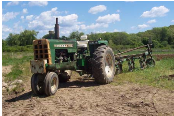
Another mighty Oliver – Rehoboth Plow Day