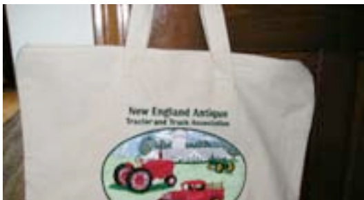
Photo shows the canvas bag.